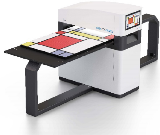
WideTEK® 36 ART-600 Front view